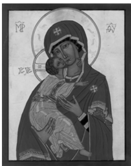
Icon by Jaime Avila

F or many, icons are simply a religious image; for some, icons are an artistic expression; others may see icons as a tool of prayer, meditation and contemplation.